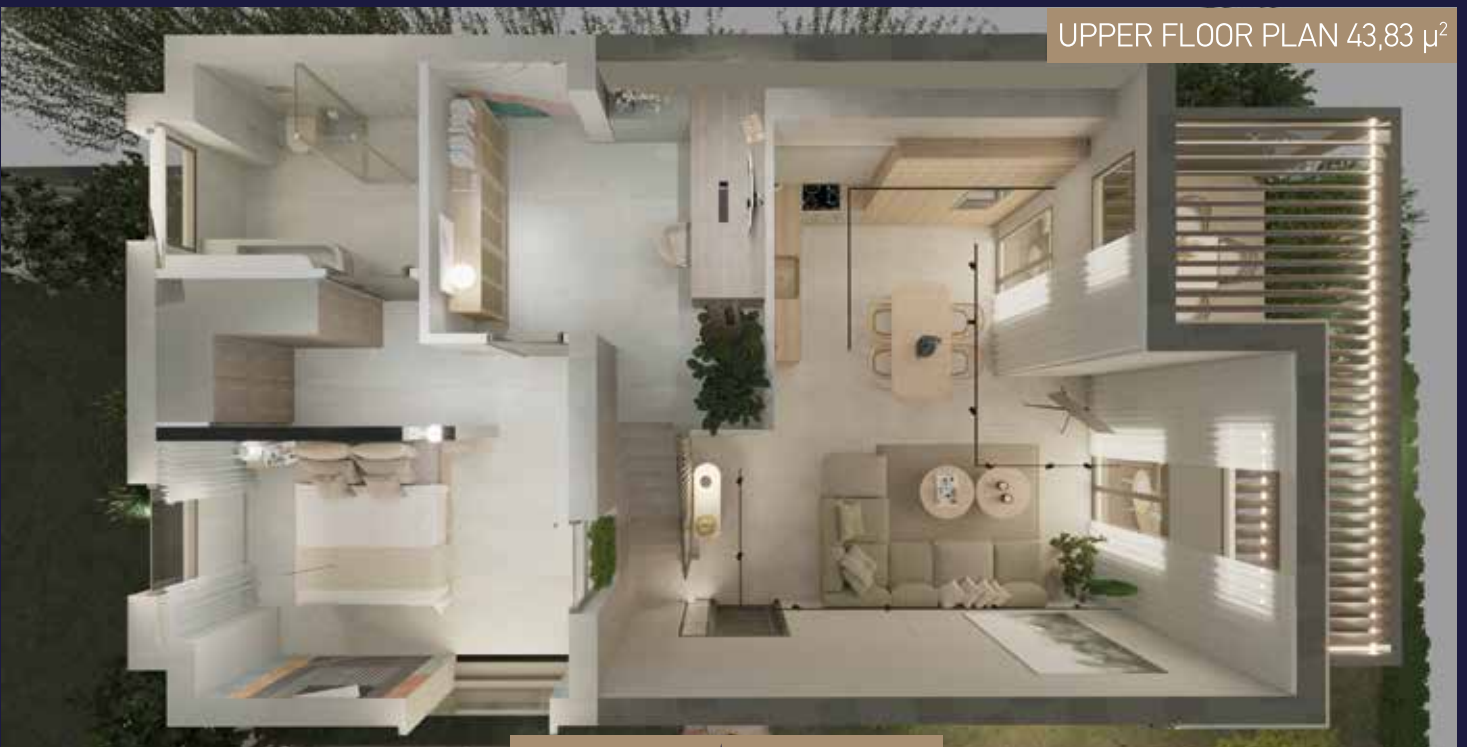
UPPER FLOOR PLAN 43,83 \mu^2

Low-growing plants form the fence of the entire plot without limiting the view and day-light